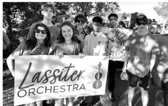
Getting ready for our annual Homecoming parade! This year's theme was Rio Carnival and the orchestra performed the song "Real in Rio."