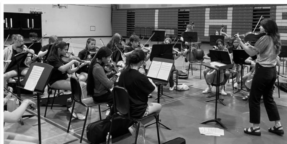
Chamber students learn to have some “fiddle fun” at Fall Camp!