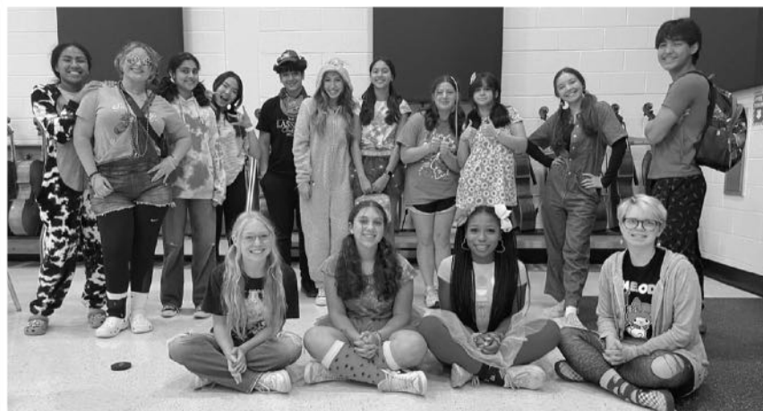
Concert Orchestra showing their school spirit during homecoming week!