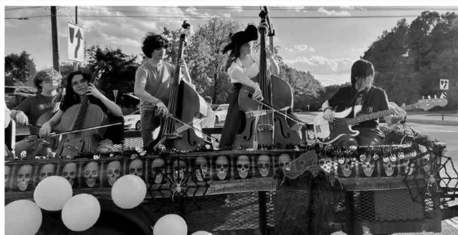
Cellos and Bases playing on the Haunted HOCO Float!